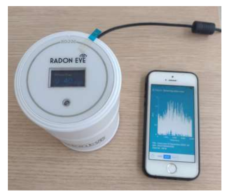
Fig.02. Data collection of radon gas made with an IPhone in 12/31/2020 (author)